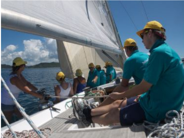
Crew work on Cotton Blossom