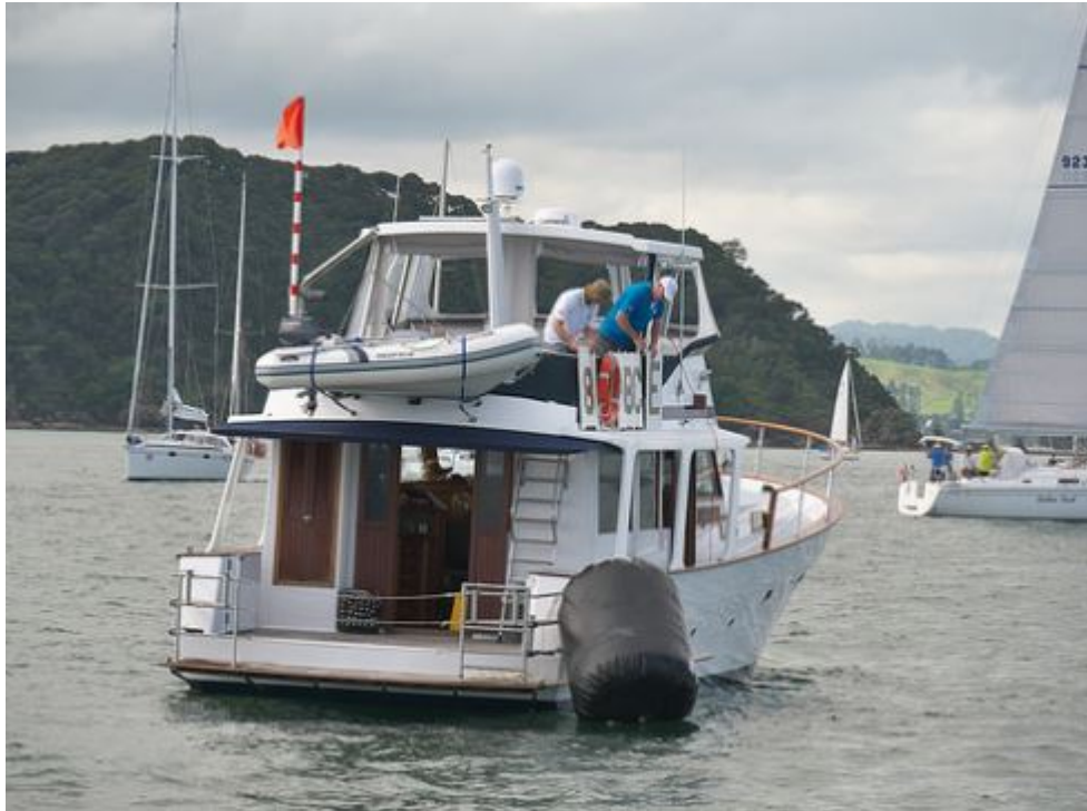
Awatea, Kerikeri boat owned by Dennis Corbett was committee boat for the Island Racing divisions.

Fore more Bay of Islands Sailing Week photos