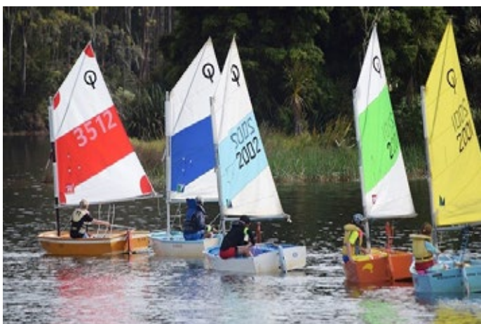
Learn to Sail students at Lake Manuwai, second time solo in an Optimist and loving it.

In October, you should have received your Club membership subscription invoice (and dinghy storage, pile mooring or trailer park invoices were applicable). Subscriptions are now due. Please pay promptly and make the most of your membership by using the facilities. The Clubhouse is very popular on Friday nights and the menu on Sundays has changed from roasts to warm season fare. Try the Thai Beef Salad or Scallops. The new addition to the dessert menu is Warm Chocolate Brownie with Fresh Cream and Ice Cream.