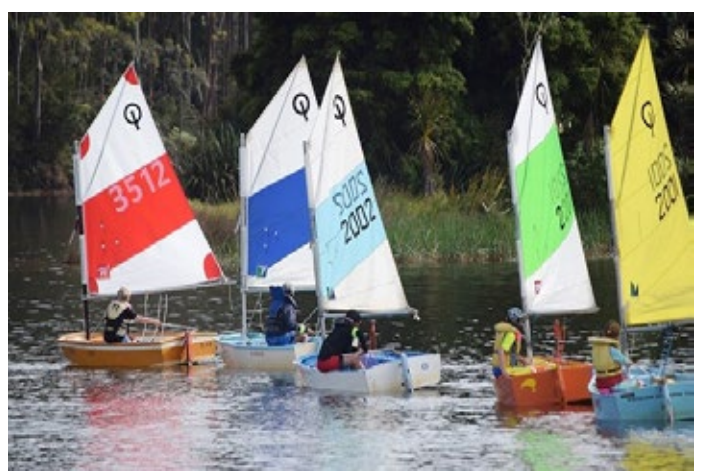
Learn to Sail students at Lake Manuwai, second time solo in an Optimist and loving it.

In October, you should have received your Club membership subscription invoice (and dinghy storage, pile mooring or trailer park invoices were applicable). Subscriptions are now due. Please pay promptly and make the most of your membership by using the facilities. The Clubhouse is very popular on Friday nights and the menu on Sundays has changed from roasts to warm season fare. Try the Thai Beef Salad or Scallops. The new addition to the dessert menu is Warm Chocolate Brownie with Fresh Cream and Ice Cream.