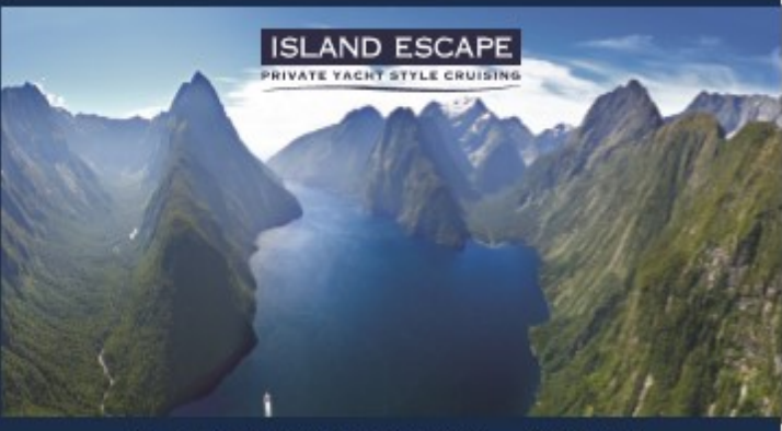
8-night CRUISE PACKAGE from $5,950*