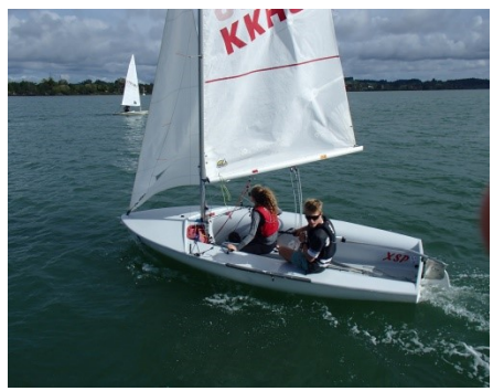
Dash for Cash start