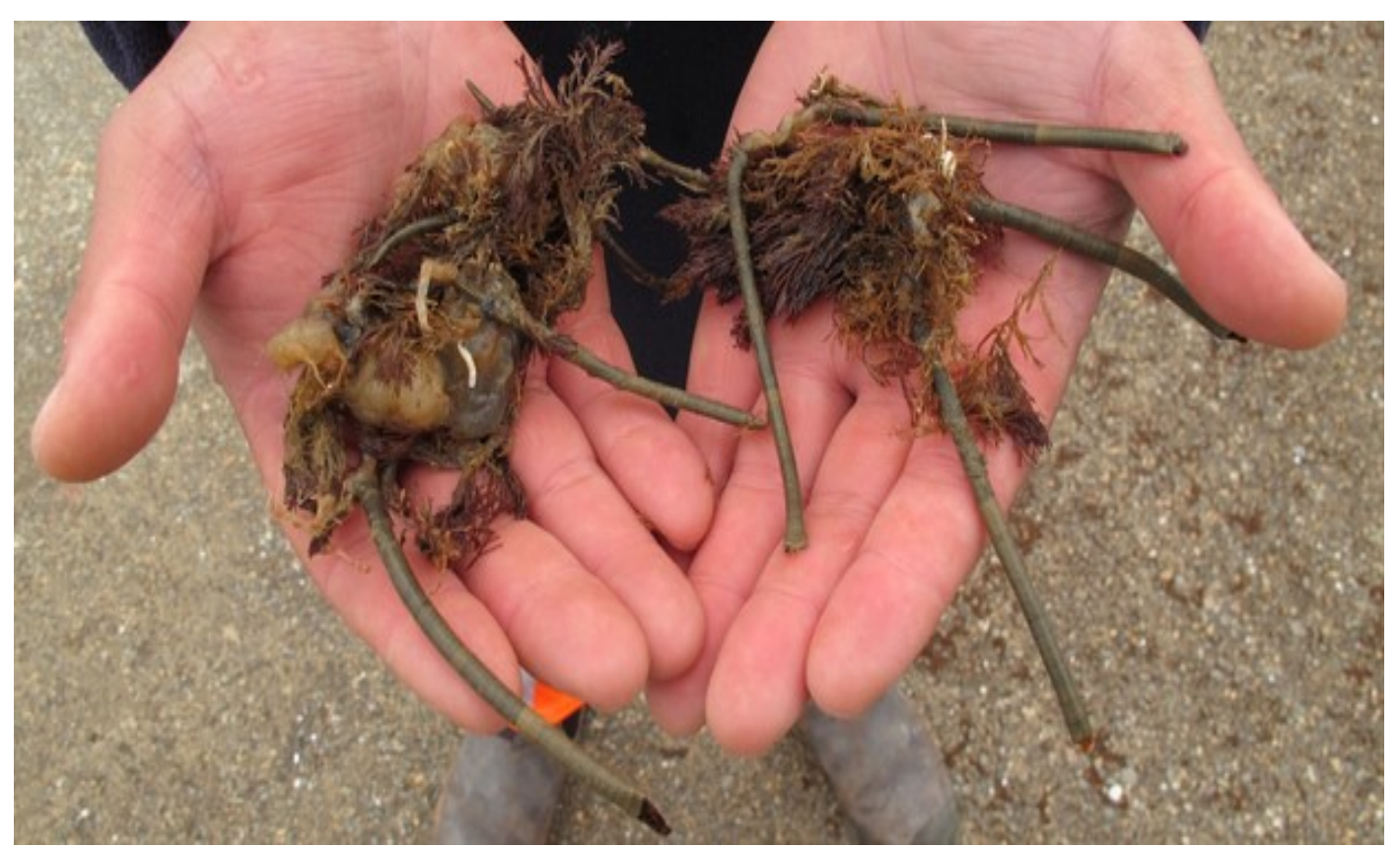
Mediterranean fanworms pose a significant environmental and economic risk.

Four Mediterranean fanworms, known as aggressive marine pests, have been found in Gisborne's Harbour. Divers from the Bay of Plenty scoured the Gisborne harbour last week after Gisborne District Council found one fanworm on the training wall in the port in June last year.